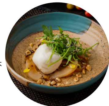
HEIRLOOM TOMATO SALAD 传家宝番茄沙拉 550 Goats cheese, smoked vinaigrette 山羊奶酪、烟熏油醋汁