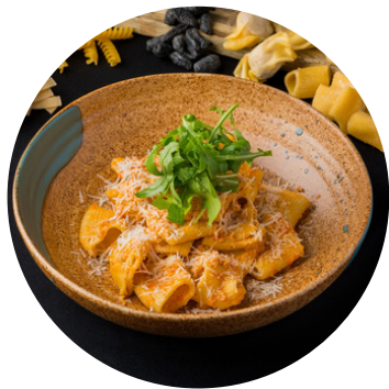
RIGATONI PESTO SICILIANA 西西里青酱宽管面 590 Sicilian red pesto, parmesan 西西里红色青酱, 帕尔马干酪