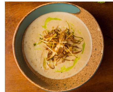
CELERIAC & ONION VELOUTÉ 芹菜根洋葱浓汤 410 Crisp leeks, chive oil 脆韭葱, 细香葱油